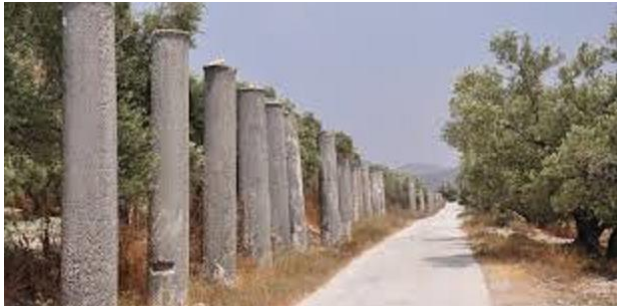
Sabastiya Town – Prophet St. John Baptist the former - Roman monuments