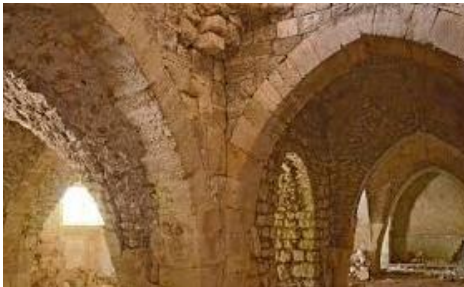
Construction of OKKAD