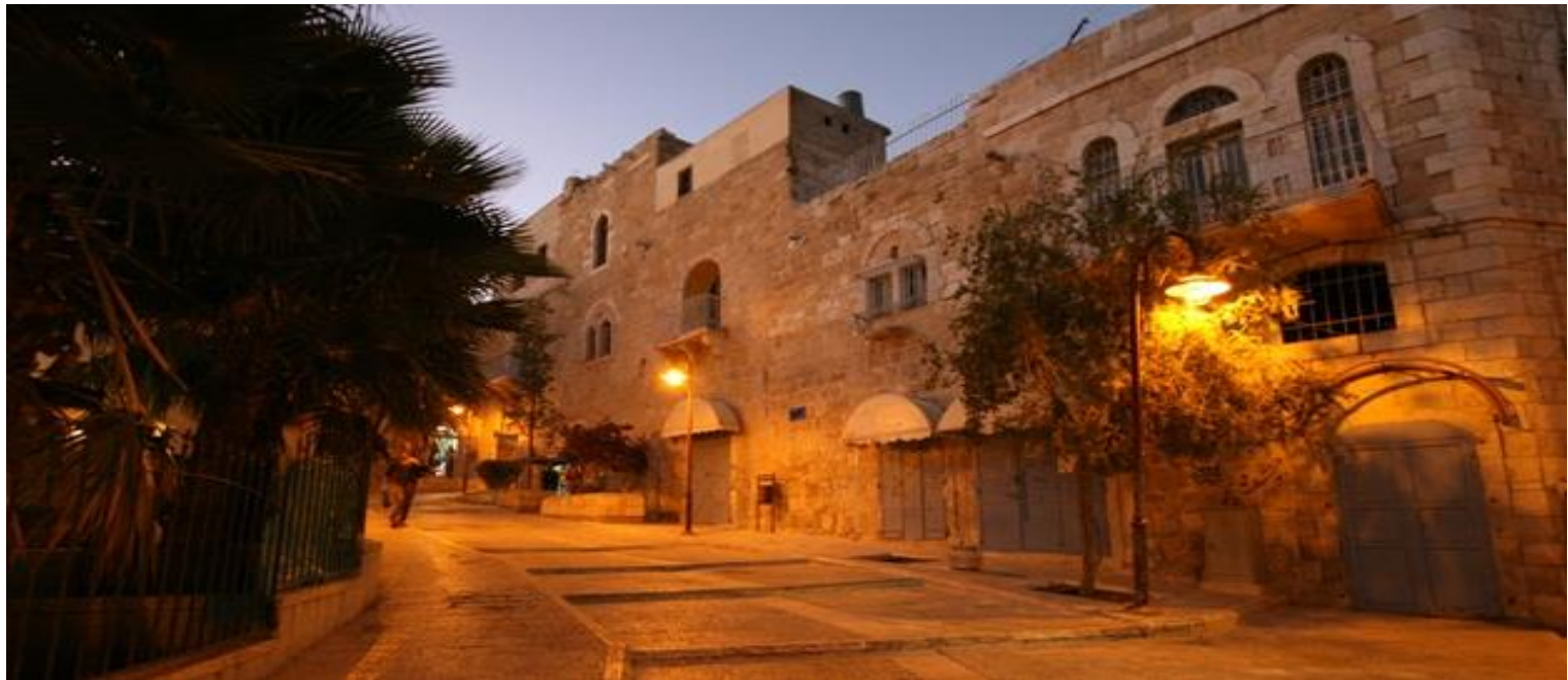
Beit Sahour - old city