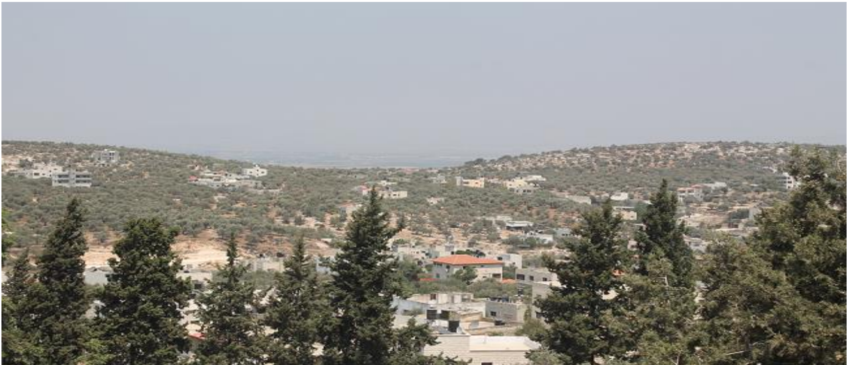
Berqeen Town - 4 th oldest church in the world/ Jesus healing 10 lepers – Landscape