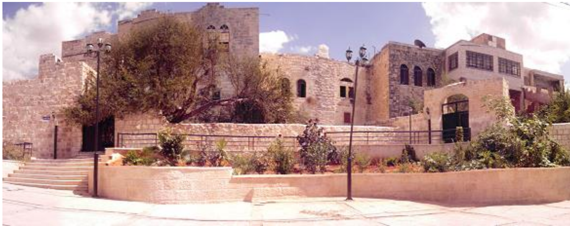
Deir Istiya Town - old town centre