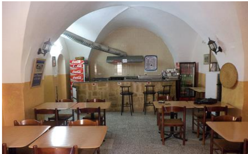
Restaurant & Kafateria house