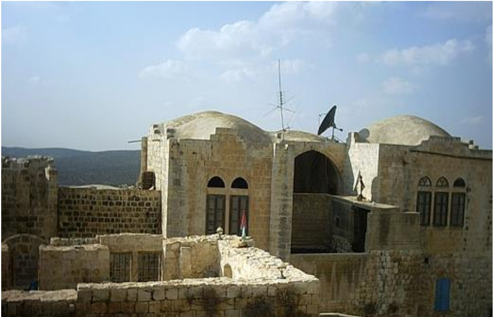
Palestinian old model of Building – OKKAD