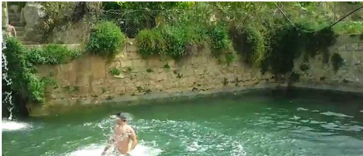
Batteer Town - landscape - Roman pool