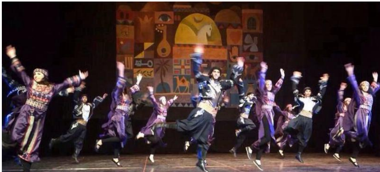
Zababdeh Town - landscape - folk band - festival of culture/art/tourism