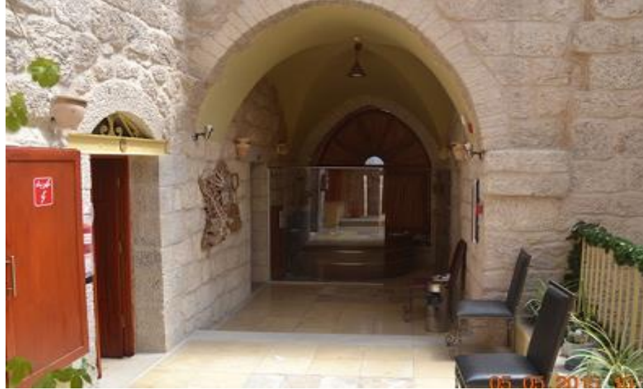
Inhabited OKKAD house